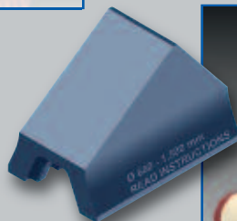
KLP® PipeStop Block C