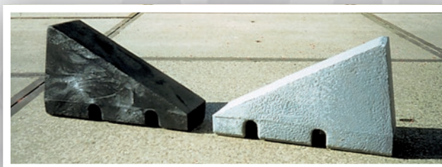
Standard (left) and Heat Resistant (right) KLP® Rollblock

Our standard Rollblock (type 55/16-2) is a true 'heavy duty' block: each Rollblock can bear about 25 tons. One coil is supported by four Rollblocks. Apart from this Rollblock we offer several other dimensions: for every coil warehouse Lankhorst Mouldings can offer the right storage system. Our sales people will be happy to assist you in finding the optimal solution.