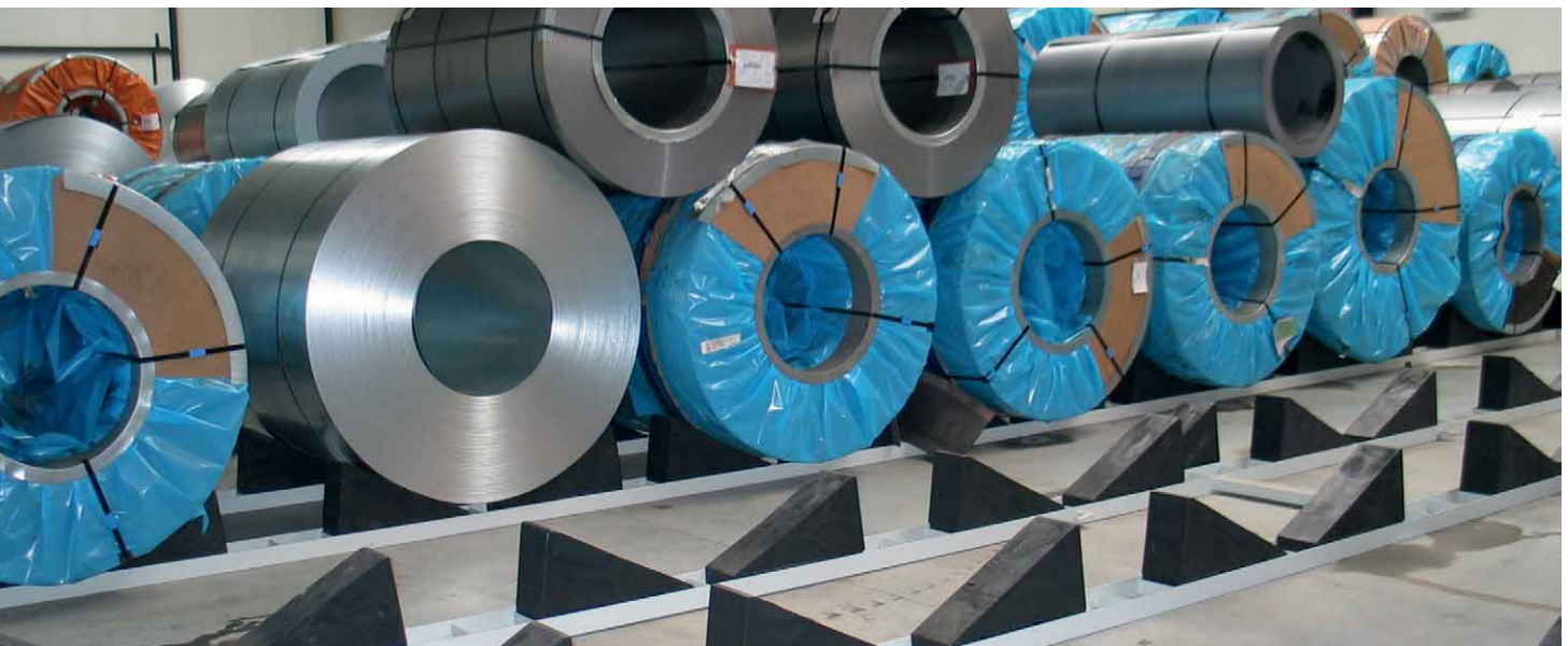
Safe and correct coil storage relies on a multitude of parameters for both, the coils and the storage place

Later on, when the storage rows are being arranged, the system will send out a warning in case the elements are